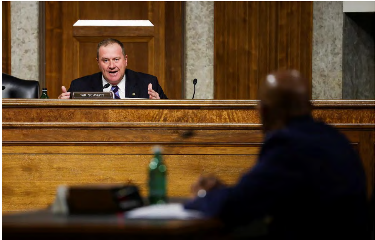
Senator Eric Schmitt speaking to U.S. Air Force General Charles Q. Brown, Jr., Washington, D.C., July 2023

When Tommy Tubberville finally lifted his blanket hold on promotions for 440 senior military officers last December, many in the Pentagon breathed a sigh of relief. The Alabama Republican had blocked the promotions to protest a Biden administration policy granting paid leave and travel reimbursement for abortion services to military personnel based in states where the procedure is illegal. For nearly ten months, officers awaiting promotion were prevented from taking on new assignments, creating bottlenecks in the chain of command and disrupting the