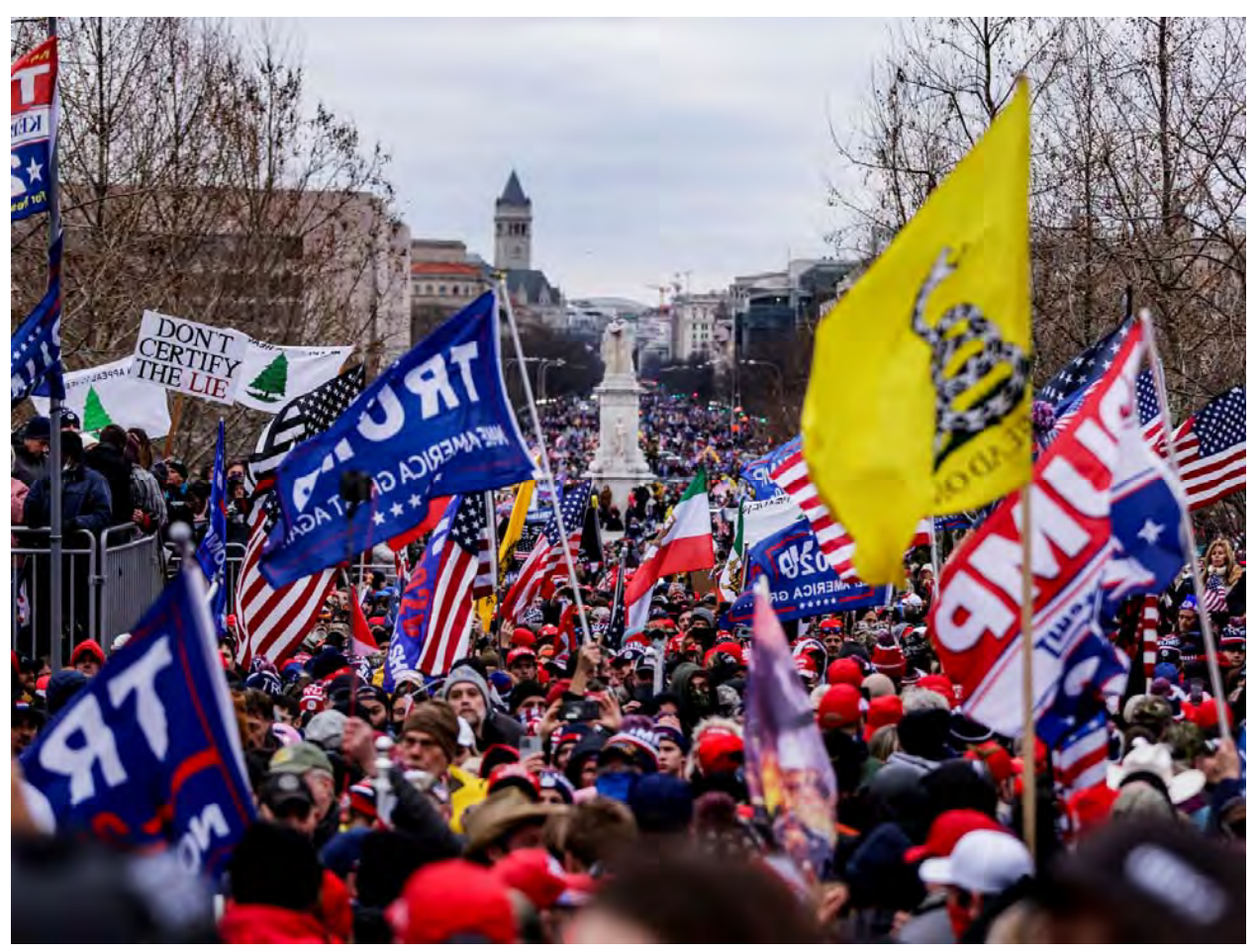
Pro-Trump supporters gather outside the U.S. Capitol following a rally with President Donald Trump on January 6, 2021 in Washington, DC.

During the chaos of the Capitol on January 6, it was impossible to miss the flags and symbols. Taken together, they allowed for a kind of brisk vexillology of the American right. There were the Trump 2020 flags, of course — and, as has been widely noted, one rioter brandished a Confederate flag in the Capitol building, a historical first. Some people waved "thin blue line" flags, meant to express support for the police and people who worked in law enforcement, even as they squared off with police officers.