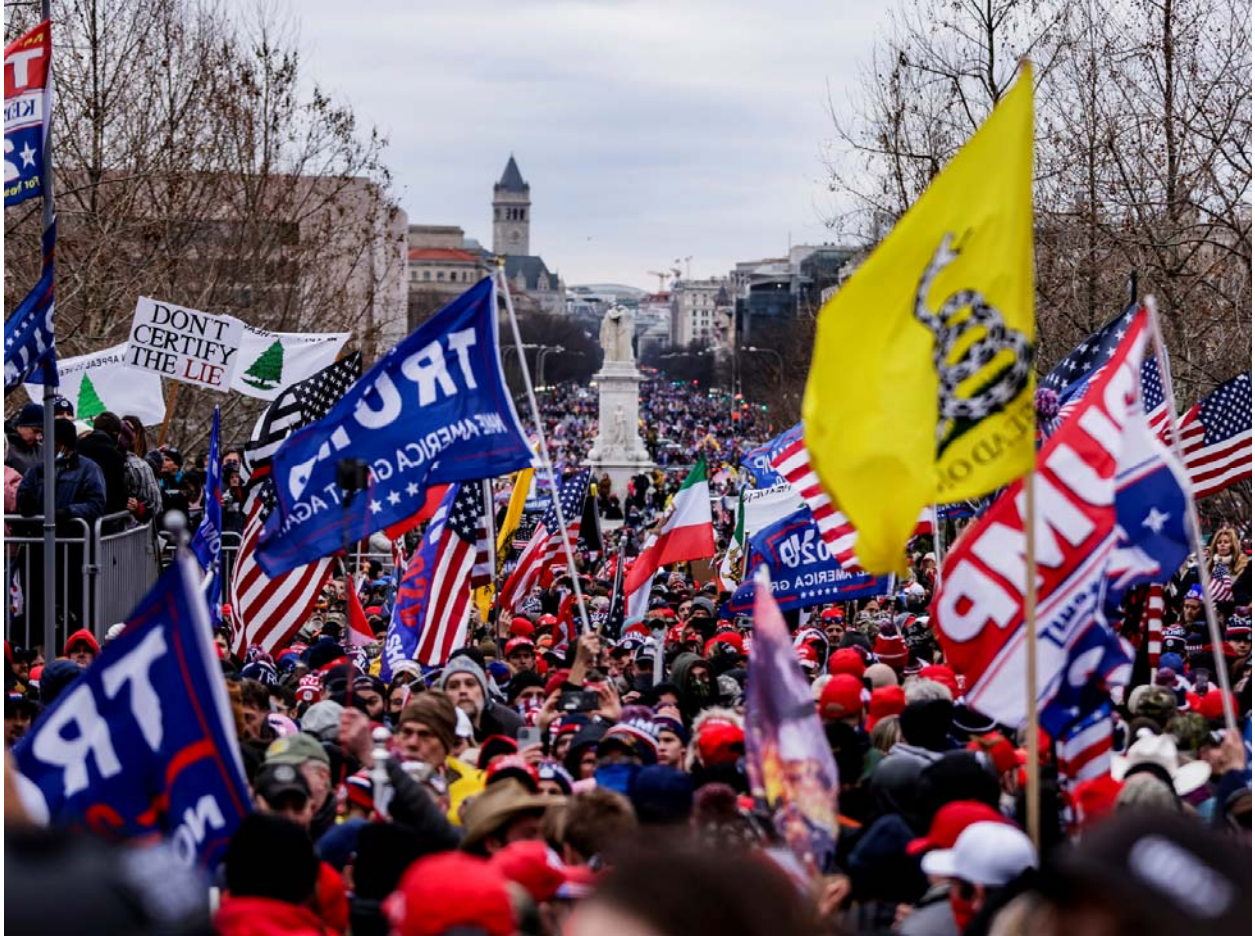
Pro-Trump supporters gather outside the U.S. Capitol following a rally with President Donald Trump on January 6, 2021 in Washington, DC.