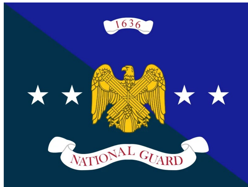
Gen Steve Nordhaus #30 Chief, National Guard Bureau

Controlled by: OCNGB Controlled by: NGB-CAG Category: OPSEC Distribution Statement: F POC: 571-256-7846