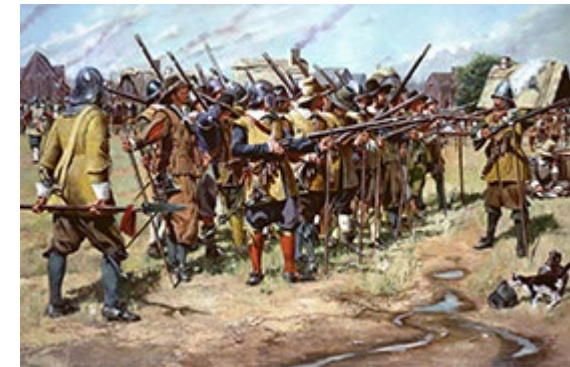
Artist's rendering of the first muster in 1636 at Salem, Massachusetts.