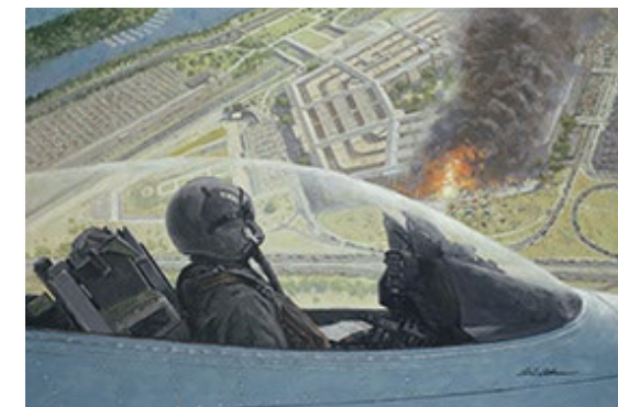
An ANG F-16 of the North Dakota 119th Fighter Wing over the Pentagon on September 11, 2001.