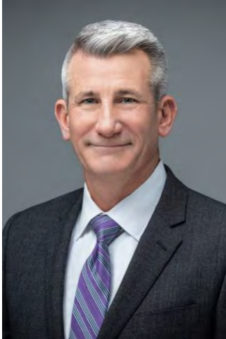
John W. Nicholson Jr. General U.S. Army Retired Senior Fellow CAPSTONE PINNACLE Program National Defense University

General (Ret) John Nicholson has been a Senior Fellow since 2019. He last served as the Commander of all U.S. Forces and the 41 nation NATO-led Coalition in Afghanistan from 2016 to 2018. Before that, he served as Commander of NATO's Allied Land Command and Commanding General of the 82nd Airborne Division. Commissioned in 1982, he served as an infantry officer at all levels with over six years in combat. He had four tours of duty in NATO commands as a general officer, living in Europe and the Middle East for over twelve years.